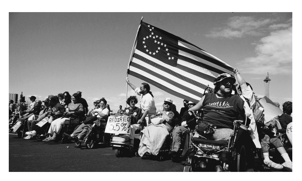
FIG. 2.2. ADAPT action protesting the American health care system, Las Vegas, 1994. Photo by Tom Olin. Reprinted with artist's permission.

unwittingly impose definitions, evaluation, and judgments about what disability is across geopolitical difference. In tandem with the brutal liberalism of such frameworks, resources are distributed, missionary-style and often unevenly, with effects that reorganize as well as reiterate hierarchies of bodily debility and capacity. Disenfranchised populations are with increasing frequency recruited for projects involving biomedical, genomic, and reproductive technologies that enable forms of capacitation for few. Crip nationalism functions both by marking investments in nationalism and national location and more perniciously by relying on the specific circumstances of a location that is unmarked, unaccounted for, and deployed as transparent universalism.