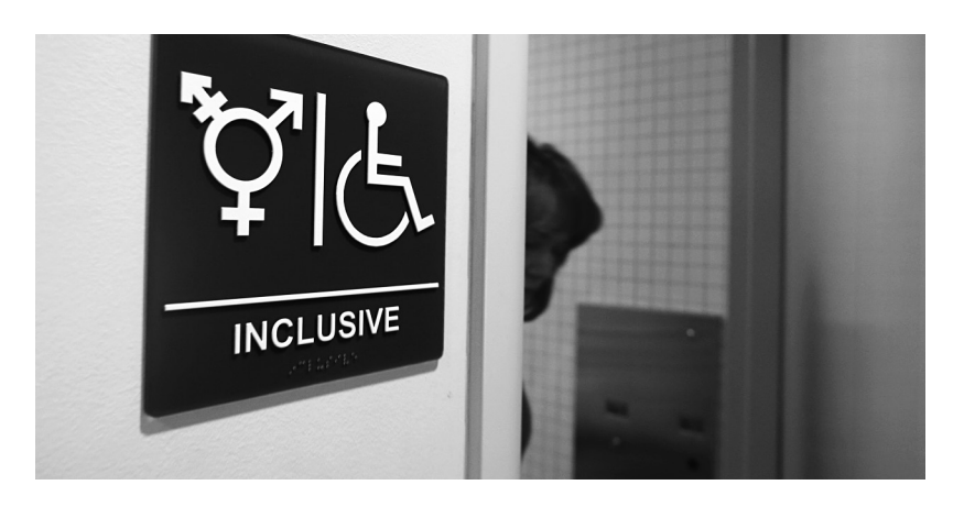
FIG. 1.1. A blue gender-neutral bathroom sign at the University of California, Irvine, September 2014.