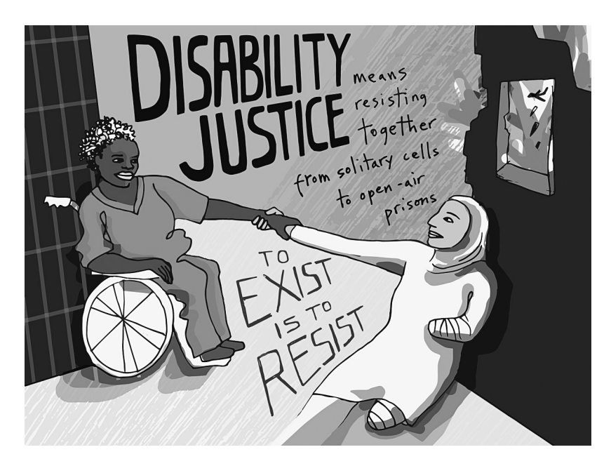
FIG. 2.1. "Disability justice means resisting together from solitary cells to open-air prisons." Micah Bazant and Sins Invalid, To Exist Is to Resist , 2014. An original drawing. Sins Invalid is a performance project that celebrates artists with disabilities, centralizing artists of color and queer and gender-variant artists. Reprinted with the artist's permission.

disability and debilitation. While resignifiying the category of disability may aid in addressing what Bryan S. Turner (quoted by Garland-Thomson) calls "ontological contingency" by deconstructing the presumed, taken-forgranted capacities-enabled status of able-bodies, such ontological contingencies should not sublimate the sociopolitical contexts within which they occur, nor be thought of by any means as "the truth of our body's vulnerability to the randomness of fate." Garland-Thomson continues: "Each one of us ineluctably acquires one or more disabilities—naming them variably as illness, disease, injury, old age, failure, dysfunction, or dependence. This inconvenient truth nudges most of us who think of ourselves as able-bodied toward imagining disability as an uncommon visitation that mostly happens to someone else, as a fate somehow elective rather than inevitable." <sup>14</sup>