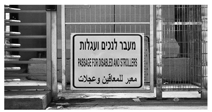
FIGS. POST.1 AND POST.2. Hebron, Shuhada Street Checkpoint, with close-up of a sign, stating "Passage for Disabled and Strollers," next to the entry turnstile, January 2016. Photos by Nitasha Dhillon. Reprinted with the artist's permission.