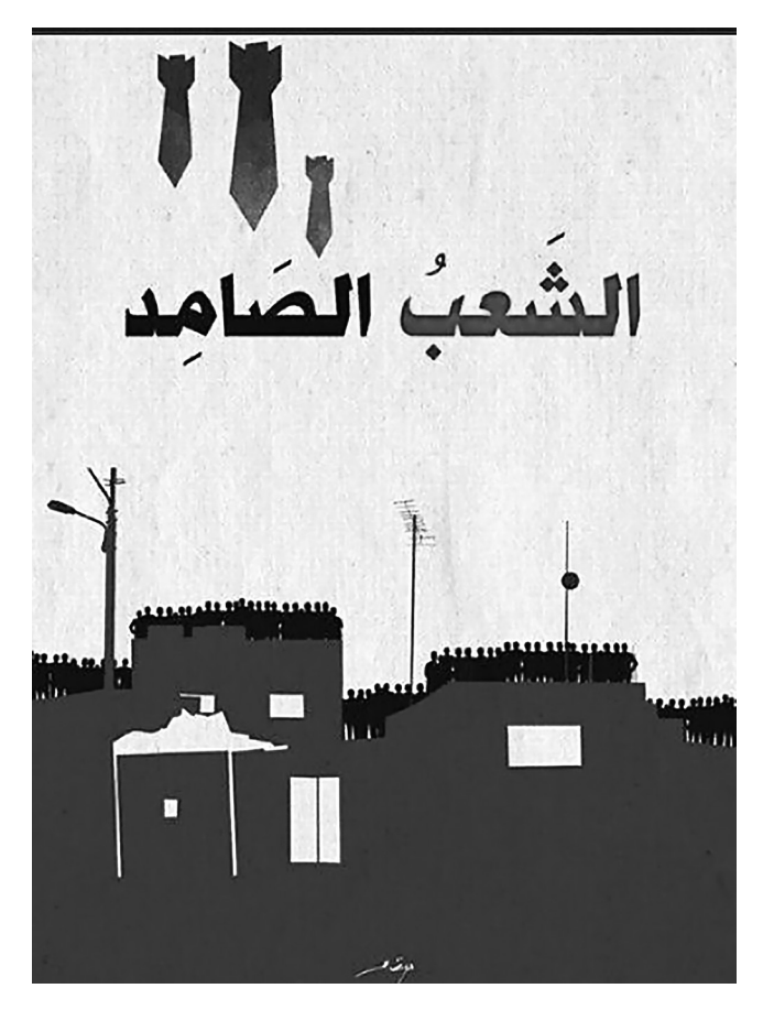
FIG. 4.2. Hafez Omar, Le peuple déterminé , Palestine, 2014. This red and black graphic symbolizes the resistance of the Palestinian people, lining the rooftops of homes while missiles point from the sky directly down at them. Reprinted with the artist's permission.

avoided and must be paid back—why does collateral damage disarticulate debilitation from death? Such a disarticulation effectively disconnects the act of violent perpetration from the effects of violence. Official terminology follows suit; for example, the designation "explosive remnants of war" suggests that the war is over and that the remnants, ranging from dumdum bullets to armament toxicity to land mines, are benign, manageable, or negligible.<sup>78</sup>