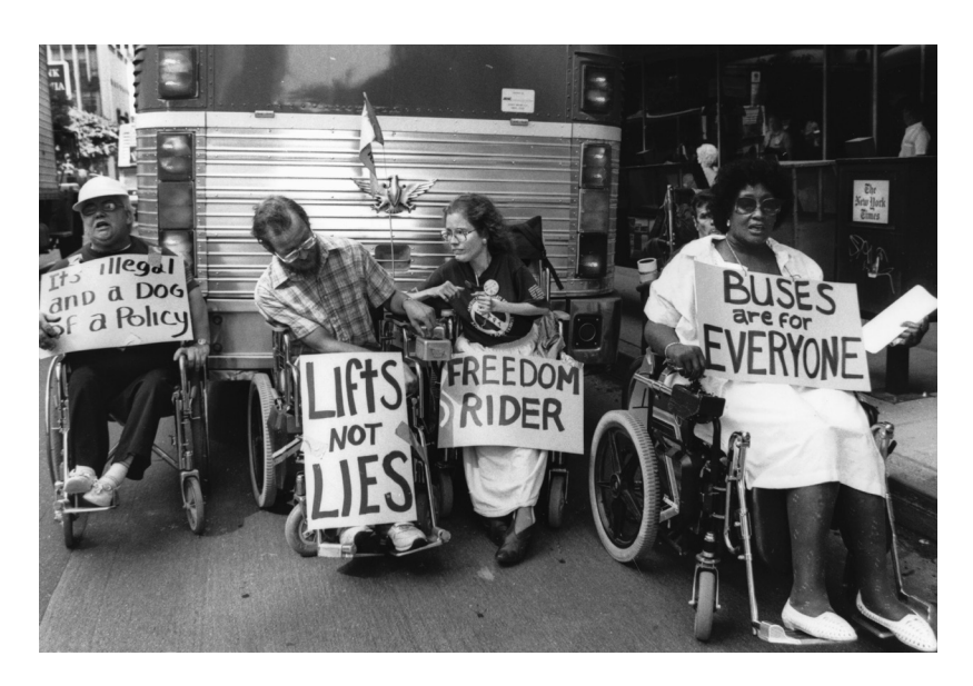
FIG. PREF.3. ADAPT activists demonstrating for accessible transportation in Atlanta, Georgia, October 1990.

Black Lives Matter and the LGBTQ rights movement as examples of this traction, she responds to her musings: "One answer is that we have a much clearer collective notion of what it means to be a woman or an African American, gay or transgender person than we do of what it means to be disabled." There is perhaps misrecognition of Black Lives Matter as a "pride" movement, not to mention that at an earlier moment in history, the disability rights movement often marked itself as both intertwined with and following in the path of the black civil rights movement. Analogies between disability and race, gender, and sexuality tend to obfuscate biopolitical realities, as Garland-Thomson's clunky list of identifications attests. Movements need to be intersectional, says Angela Davis, and the rapid uptake of this seasoned observation is invigorating and hopeful. This invocation of intersectional movements should not leave us intact with ally models but rather create new assemblages of accountability, conspiratorial lines of flight, and seams of affinity.