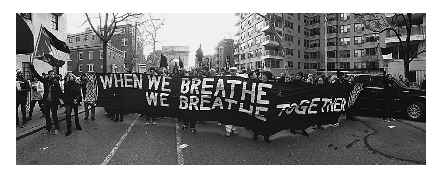
FIG. PREF.4. The Palestine contingent at the Millions March, New York City, December 2014. The ends of the banner display the pattern of the Palestinian keffiyeh. The Washington Square Arch is visible in the background. Photo courtesy of Direct Action Front for Palestine. Reprinted with artist's permission.