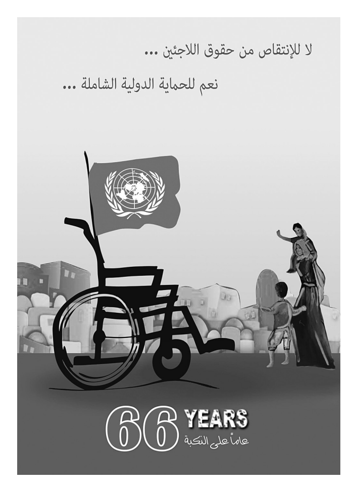
FIG. 4.1. Haj Abdullah, No to Undermining [Palestinian] Refugee Rights, Yes to Comprehensive International Protection, 2014. The image shows a wheelchair with a United Nations flag in front of Palestinian people, marking sixty-six years of ineffective international aid. The poster received second place in Badil's annual Al Awda Award Competition in the category of Best Poster of 2014. The theme for that year's competition was "No to undermining Palestinian refugee rights. Yes to comprehensive international protection." In Badil's opinion, while the poster reflects the ongoing plight and displacement of Palestinian refugees, it demonstrates the international community's lack of fulfillment of its obligations toward Palestinian refugees, which includes the right to live in dignity through the provision of services until which time their refugee status is resolved through the exercise of their right of return. © Badil, Artist Daoud Haj Abdullah.