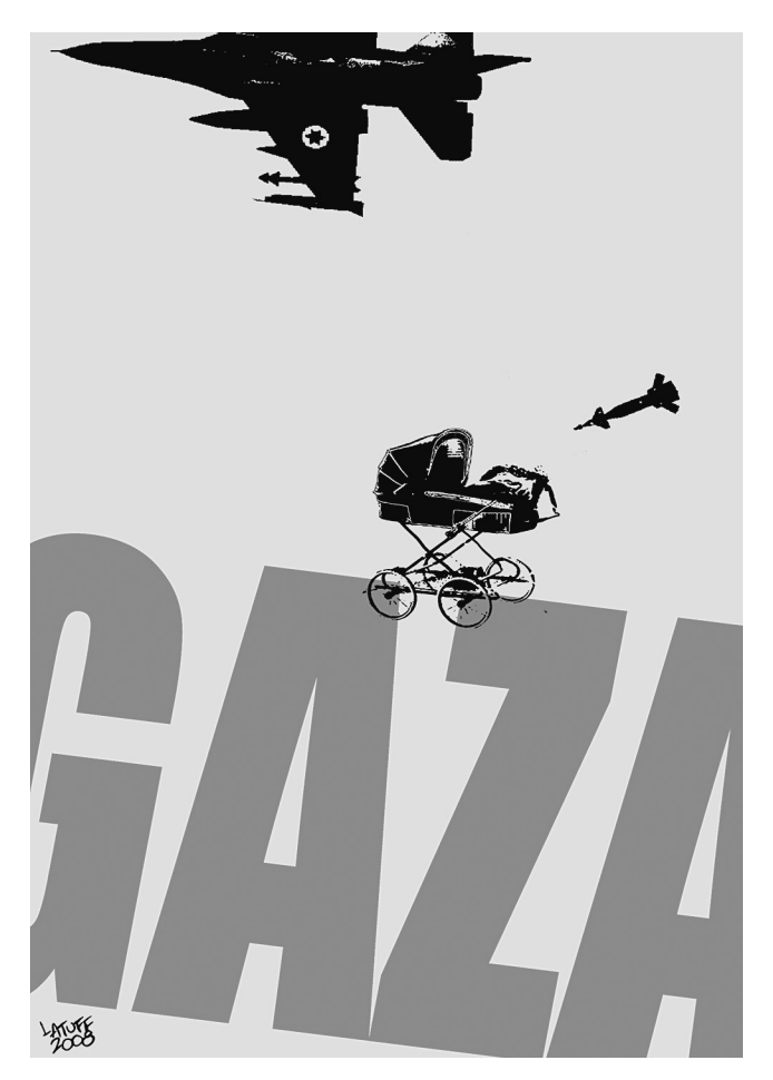
FIG. 4.3. Carlos Latuff, Gaza , 2008, Brazil. Reprinted with the artist's permission.

Israeli state," in large part because they are produced as "always already terrorists" and rendered nonhuman.<sup>110</sup> Efforts from human rights organizations to place the IDF on a United Nations list of serious violators of human rights because of the deaths of more than five hundred children and the injuries of at least thirty-three hundred during the siege of 2014 have been fraught and apparently stalled due to political pressure from the Israeli state.<sup>111</sup>